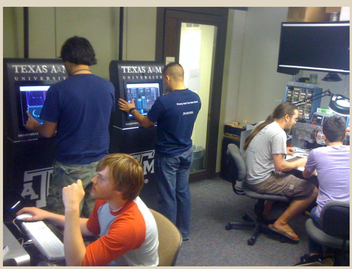
Crowded teaching areas and office spaces in Academic Building